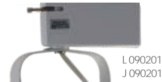
L 090201 J 090201