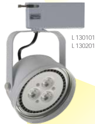
L 130101 L 130201